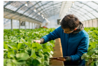
Trading in plants and plant products