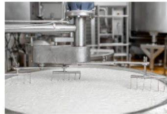
Trading in animals and animal products