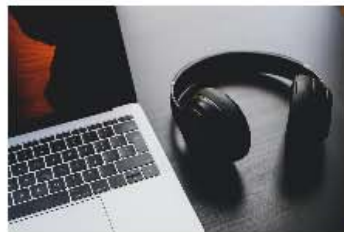
Webinars and 'how to' guides