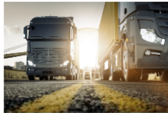
Register to import or export

You need to act now to avoid serious disruption to your business.