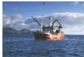
Agri-food and fisheries sectors