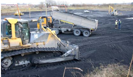
Fill being added to the site in February 2009

The stadium will include a substantial 190 seat restaurant, private hospitality suites and gallery bars, all of which will be a significant attraction for people in the mid-west region. It will also create 100 permanent jobs for the Limerick area.