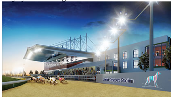
An artist's impression of the completed stadium

Limerick Greyhound Stadium, which will also house the new headquarter offices of the Irish Greyhound Board, will be a pre-eminent greyhound racing and hospitality stadium. It will host over 1,200 races a year and have a capacity attendance of 2,900, putting it among the top rank of greyhound racing stadia on an international scale.