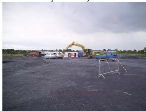
June 2009 - John Sisk & Son open their site offices